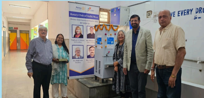
Rotary Club of Delhi West and supported by it's Foundation, Sarvarth, gifted a Water Cooler with Purifier to Kendriya Vidhyalaya, INA