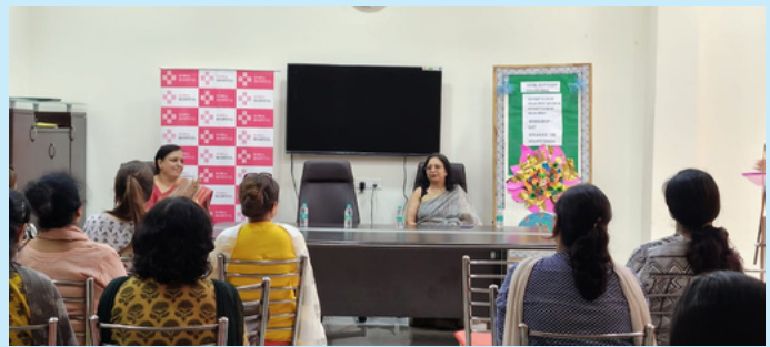
Rotary Club of Delhi West organised a Workshop on Eye Health for Faculty and Staff of S D Public School, East Punjabi Bagh on 21 st May, and Workshop on ENT on 22 nd May.