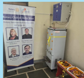
RC Delhi West and Sarvarth foundation donated a Water Cooler with Purifier to Masonic Public School, Vasant Kunj.